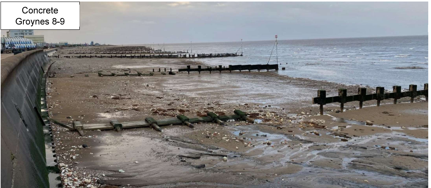
Concrete Groynes 8-9

We have appointed Southbay Civil Engineering to undertake these removal works and anticipate works will begin the week commencing 27 th January 2025. Works are expected to take 5 working days to complete.